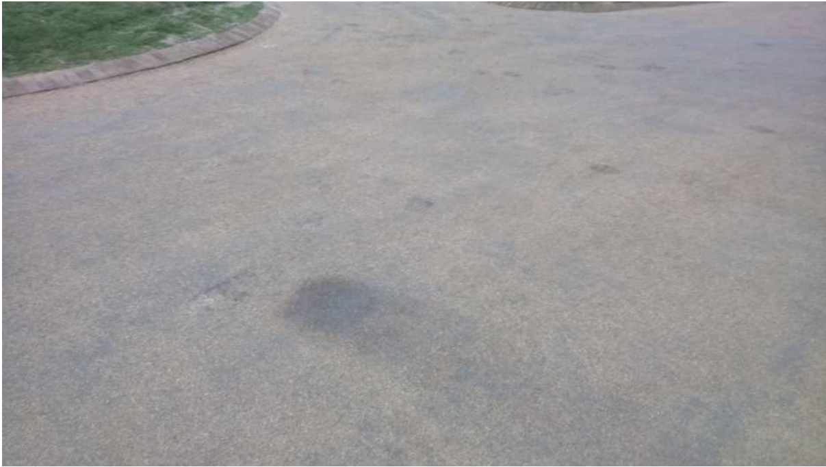
Attachment 4 - Scuff marks on path surface from motor vehicles