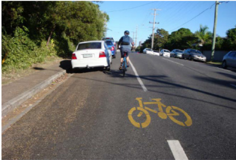
Inappropriate application of a Bicycle Awareness Zone, encouraging cyclists to travel in the 'door zone', with symbol set into an edge line adjacent to parking (Richmond Road, Morningside).

TRUM Figure 4.1.1-A provides dimensions for Bicycle Awareness Zones on a two-laned general traffic road with parallel parking that are significantly safer.