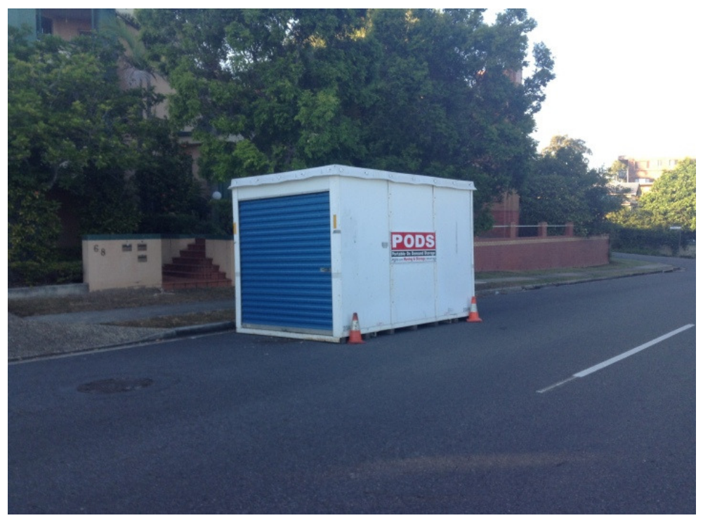
Adamson Street, Wooloowin. Yes, streets really aren't wide enough through here for safe cycling infrastructure .... where would residents leave their storage sheds?

However, based on BCC records of illegal parking complaints and infringements issued, it is evident there is a widespread attitude among motorists that they should be able to park wherever they like regardless of the inconvenience or risk they pose to others.