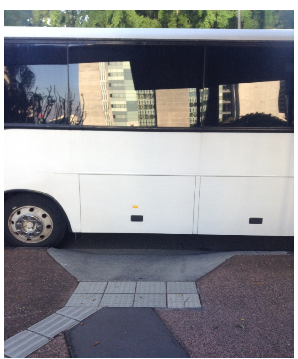
Bus obstructing kerb ramp, Albert St, CBD (June 2014)

The Monash Alfred Cyclists Crash Study from 2012 showed in almost 23% of crashes that involved another vehicle, that vehicle was parked. [30]