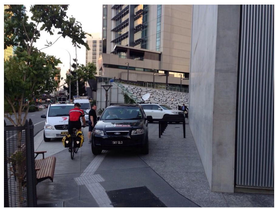
Media vehicles obstructing Roma St footpath beside the Brisbane Supreme and District Courts complex (October 2013)

The CBD BUG calls for BCC to amend its town planning requirements to remove the obligations on proponents of development applications to provide minimum mandated numbers of car parking spaces.