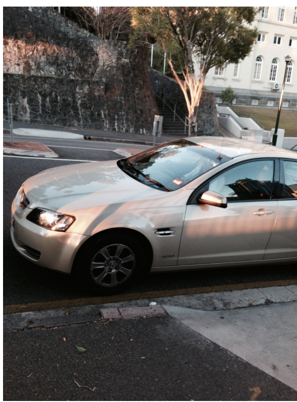
Vehicle obstructing Albert St pedestrian /crossing point with pedestrian refuge island (June 2014)

However, parking infringement fine revenue growth is also attributable to the 25% jump in per annum complaints from the public about illegal parking, resulting in this problem now recording the greatest number of complaints to BCC. [36]